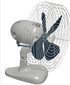
Design Exploration session : Full Cage Session name: FAN_DEX